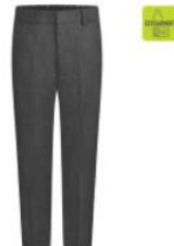
Boys Grey School Trousers with Waist Adjuster by Zeco