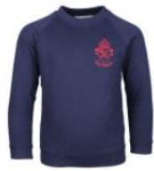
Hale Round Neck Sweatshirt by Trutex