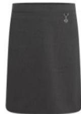
Grey Lycra Skirt with Heart Detail