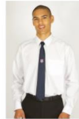
Pack of 2 Long Sleeve Polycotton Easycare White Shirts by Trutex