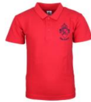
Hale Polo Shirt by Trutex