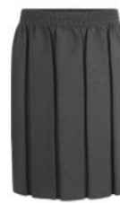
Grey Box Pleat Skirt