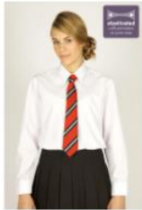
Pack of 2 Long Sleeve Polycotton Easycare White Blouses by Trutex