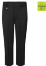
Boys Elastic Back Pull Up Grey School Trousers by Zeco