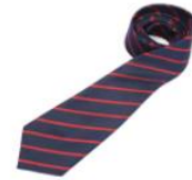
Hale School Tie