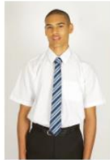
Pack of 2 Short Sleeve Polycotton Easycare White Shirts by Trutex