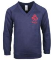
Hale V Neck Sweatshirt by Trutex