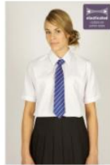
Pack of 2 Short Sleeve Polycotton Easycare White Blouses by Trutex